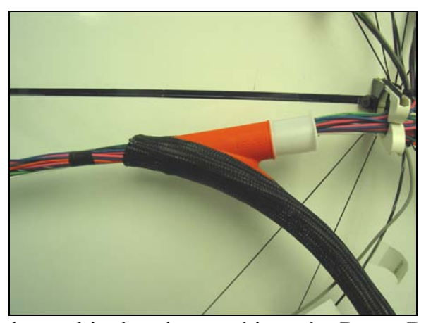
The "spreader" of the tool is then inserted into the PowerBraid. With the tool inserted, pull the tool down the length of the PowerBraid. This will insert the harness into the braid as it is pulled.