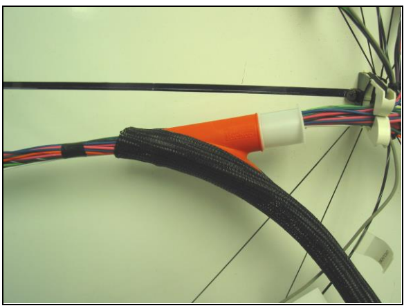
The "spreader" of the tool is then inserted into the PowerBraid. With the tool inserted, pull the tool down the length of the PowerBraid. This will insert the harness into the braid as it is pulled.