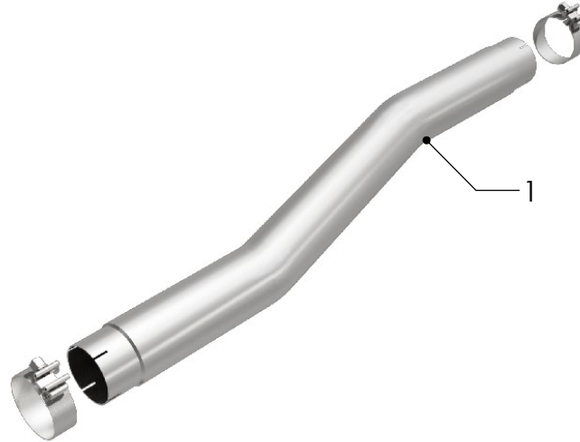
1. MUFFLER DELETE PIPE