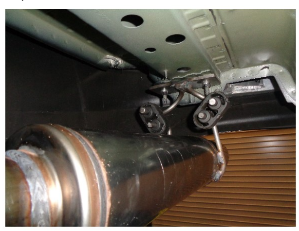
Step 4: Using the existing studs located on the factory frame rail mount the supplied Hanger Assembly with the supplied M8 lock nuts and washers.

MAGNAFLOW: 1901 Corporate Centre Dr - Oceanside, CA 92056 | 1(800)990-0905 Technical Support: 1(800) 959-9226 | Email: moreinfo@magnaflow.com