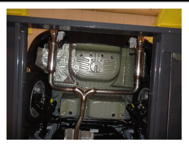
Step 5: Next s lip the P/S Muffler Assembly onto the Y-Pipe Assembly and loosely fasten with the supplied 2.25" Clamp. Using the supplied Rubber insulators attach the hangers. Fit the D/S Muffler Assembly in the same manner using the supplied clamp and OE rubber insulators.