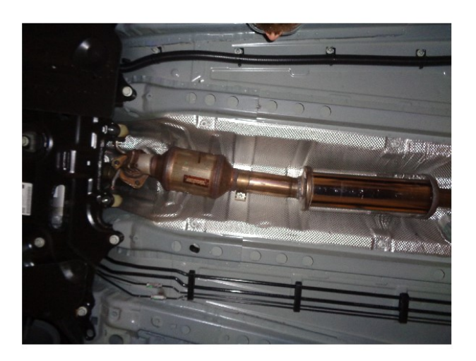
Step 2: Begin installing your new system by sliding the Resonater Assembly over the cut pipe and loosley attaching with the provided 2.38" clamp. Engage the hanger to the rubber insulator.