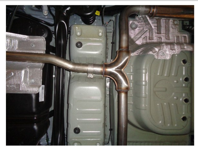
Step 3: Next loosely fasten the Y-Pipe Assembly to the Resonator Assembly using the supplied 2.25" clamp.