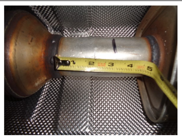
Step 1: To install the MagnaFlow exhaust the OE system must be cut. Measure 3.00" back from the catalytic converter weld, cut at this point and deburr pipe. Working front to rear disengage all welded hangers from the rubber insulators. The OEM exhaust system can now be removed in one piece. Be sure to retain the rubber hanger insulators as they will be needed to install your new MagnaFlow system.