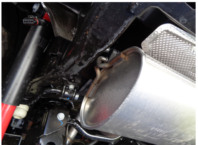
Step 1: To remove the OEM system first locate the clamp in front of the rear Muffler Assembly(located above the rear axle/sway bar)and loosen. With the Muffler supported extract the hangers from the rubber insulators and remove the muffler Assembly. Retain rubber insulators to be re-used in new installation.