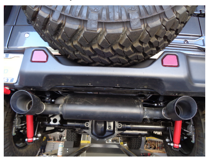
Step 3: Once a final position has been chosen for the new exhaust system, evenly tighten all clamps from front to rear using the torque specifications on page one of these instructions. Inspect all fasteners after 25-50 miles for operation and re-tighten if necessary.

MAGNAFLOW: 1901 Corporate Centre Dr - Oceanside, CA 92056 | 1(800)990-0905 Technical Support: 1(800) 959-9226 | Email: moreinfo@magnaflow.com