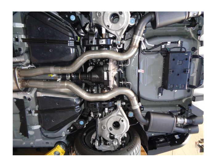
Step 4. Next attach the Mid Pipe Assemblies to the X-Pipe using the supplied 3.00" clamps and fitting the hangers into the rubber insulators.