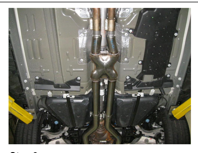
Step 3. Begin installation of the new system by loosely attaching the X-Pipe Assembly to the outlets using the OEM clamps. Leave all clamps loose until final adjustment.