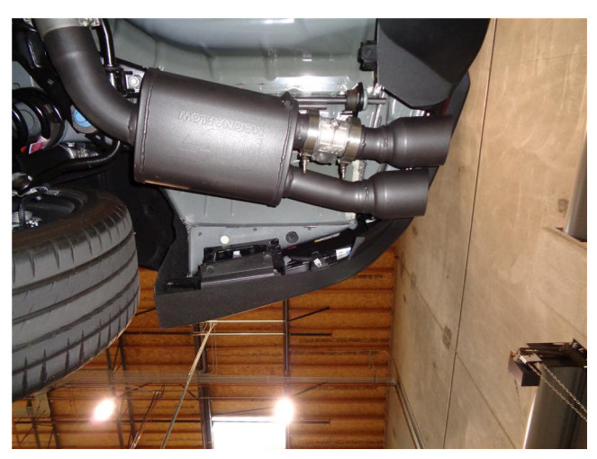
Step 5. Finish the initial installation by fitting the Muffler Assemblies onto the Mid pipe Assemblies using the supplied 3.00" clamps and inserting the hangers into the rubber insulators.