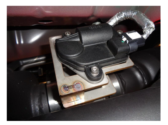
Step 6 . If your vehicle has valves, re-connect the wiring harness plugs to the Valve motors and wire mounting bracket. If not yet purchased, Valve Kit is part# 10805