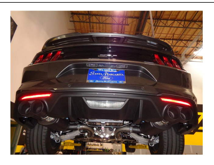
Step 7. Once a final position has been chosen for the new exhaust system, evenly tighten all clamps from front to rear using the torque specifications on page one of the instructions. Inspect all fasteners after 25-50 miles of operation and re-tighten if necessary.