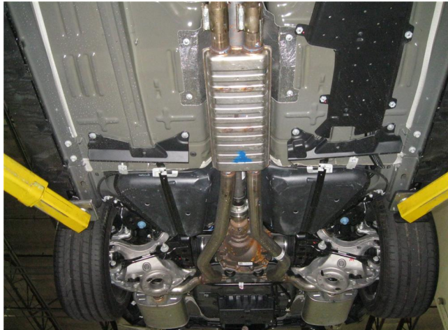
Step 2. Begin removing the OEM exhaust system by loosening the clamps located in front of the resonator. Next working front to rear extract the hangers from the rubber insulators and remove the OEM system. Retain insulators and clamps as they will be used to install the new system.