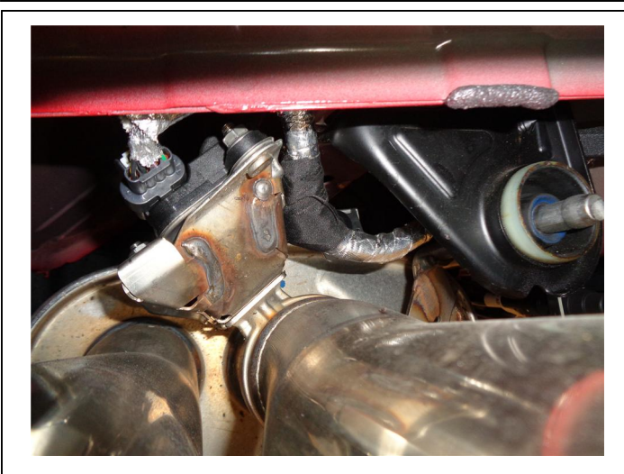
Step 1. To begin, determine if your vehicle has OE exhaust valves, if so, you will need to unplug and the electrical connection on the Exhaust Valve Control Motors (Qty 2)located on the OEM exhaust assembly, also disconnect wire harness mounting plug.