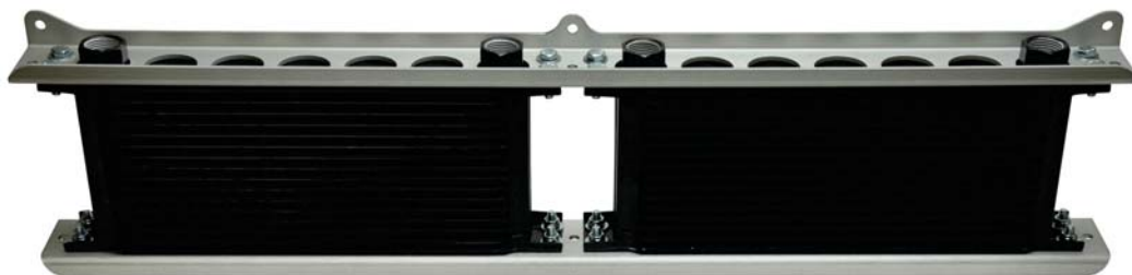
Brackets mounted to 16 Row Stacked Plate Coolers