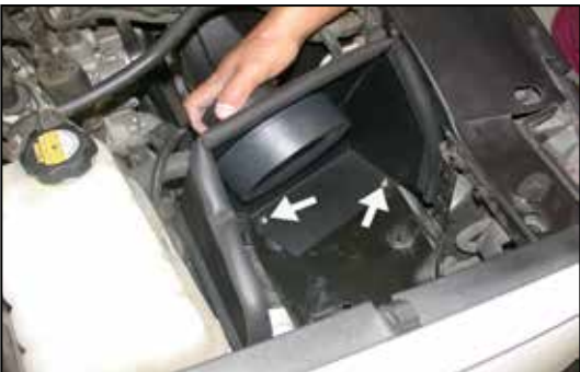
12. Install the heat shield onto the rubber mounted studs as shown.