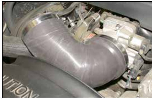
14. Install the silicone angled hose and hose clamps onto the throttle body but do not tighten at this time.