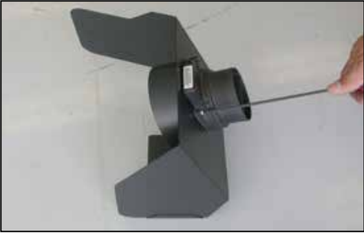
10. Using the provided hardware assemble the mass air adapter, heat shield, gaskets, and the stock mass air sensor as shown.