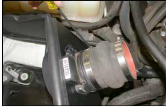
15. Install the silicone step hump hose and hose clamps onto the mass air sensor and tighten as shown.