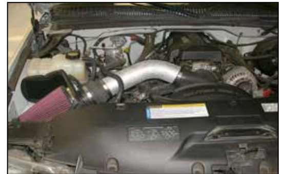
20. Reconnect the vehicle's negative battery cable. Double check to make sure everything is tight and properly positioned before starting the vehicle.