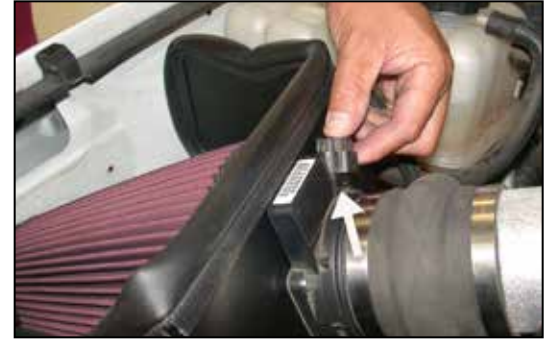
19. Reconnect the mass air sensor electrical connection as shown.