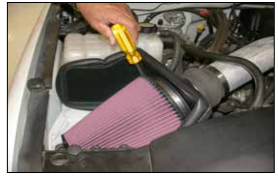
18. Install the K&N® air filter onto the mass air adapter and secure with the provided hose clamp as shown.