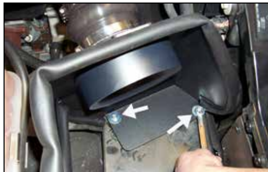
17. Tighten the hardware on the heat shield as shown.