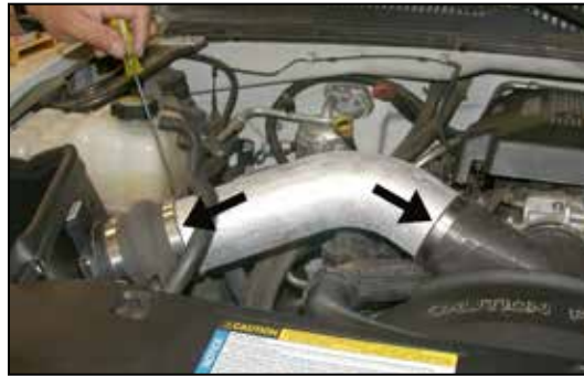
16. Install the K&N® intake tube into the angled hose, then, slide the other end into the hump hose. Adjust everything for best fit and clearance then tighten the hose clamps as shown.