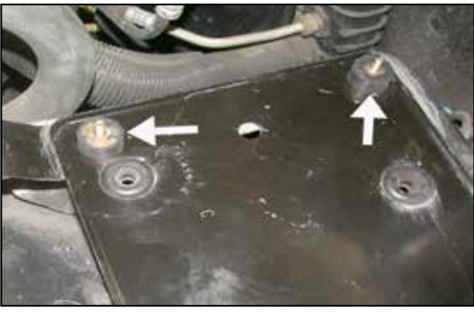
9. Install the rubber mounted studs as shown and tighten firmly.