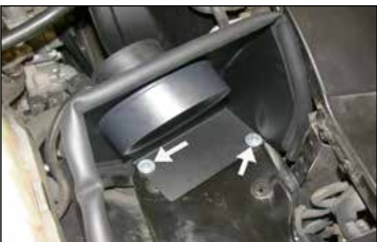
13. Secure the heat shield to the rubber mounted studs using the provided hardware but do not tighten at this time.