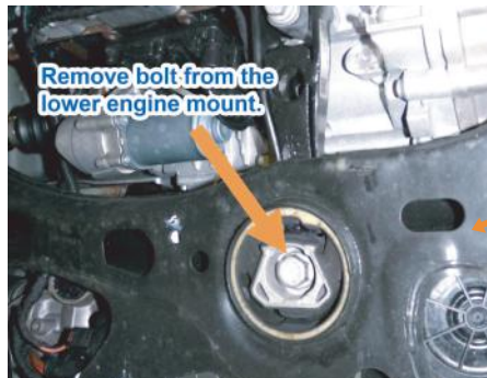
Bottom view of the front subframe