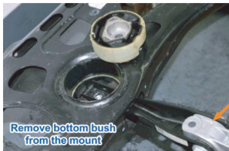
Engine mount connecting rod.