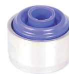
Fit onto bush