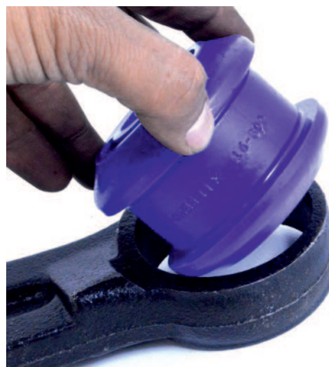
Place the bush on an angle