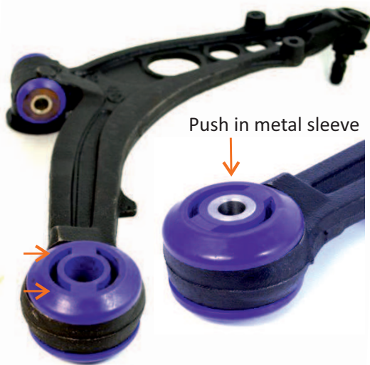
Position bush slots