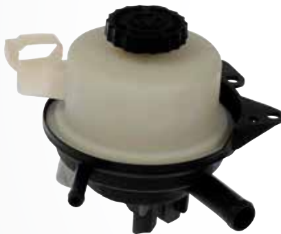
603-934 2007-01 Chrysler Caravan, Grand Caravan, Town & Country, Voyager