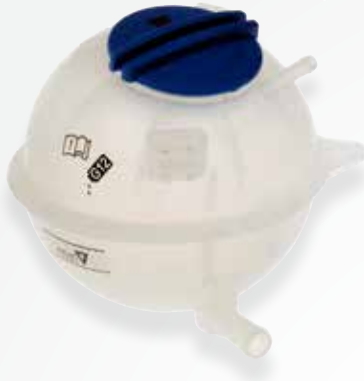
603-350 VW Beetle 2010-98