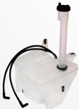
603-159 Ford Explorer 2010-02, Lincoln Aviator 2005-03, Mercury Mountaineer 2010-02